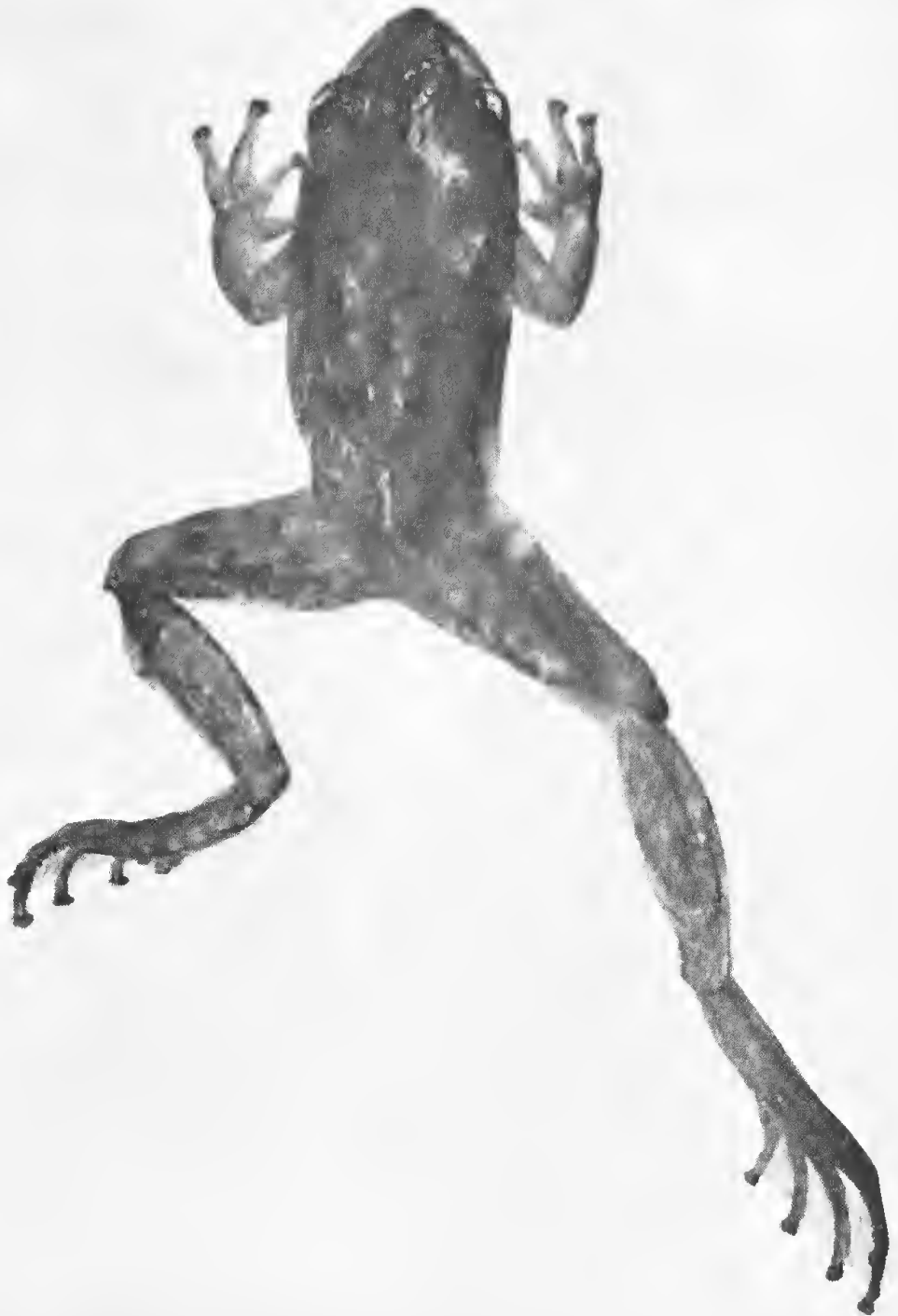
FIG. 2. H. meiriana sp. nov.